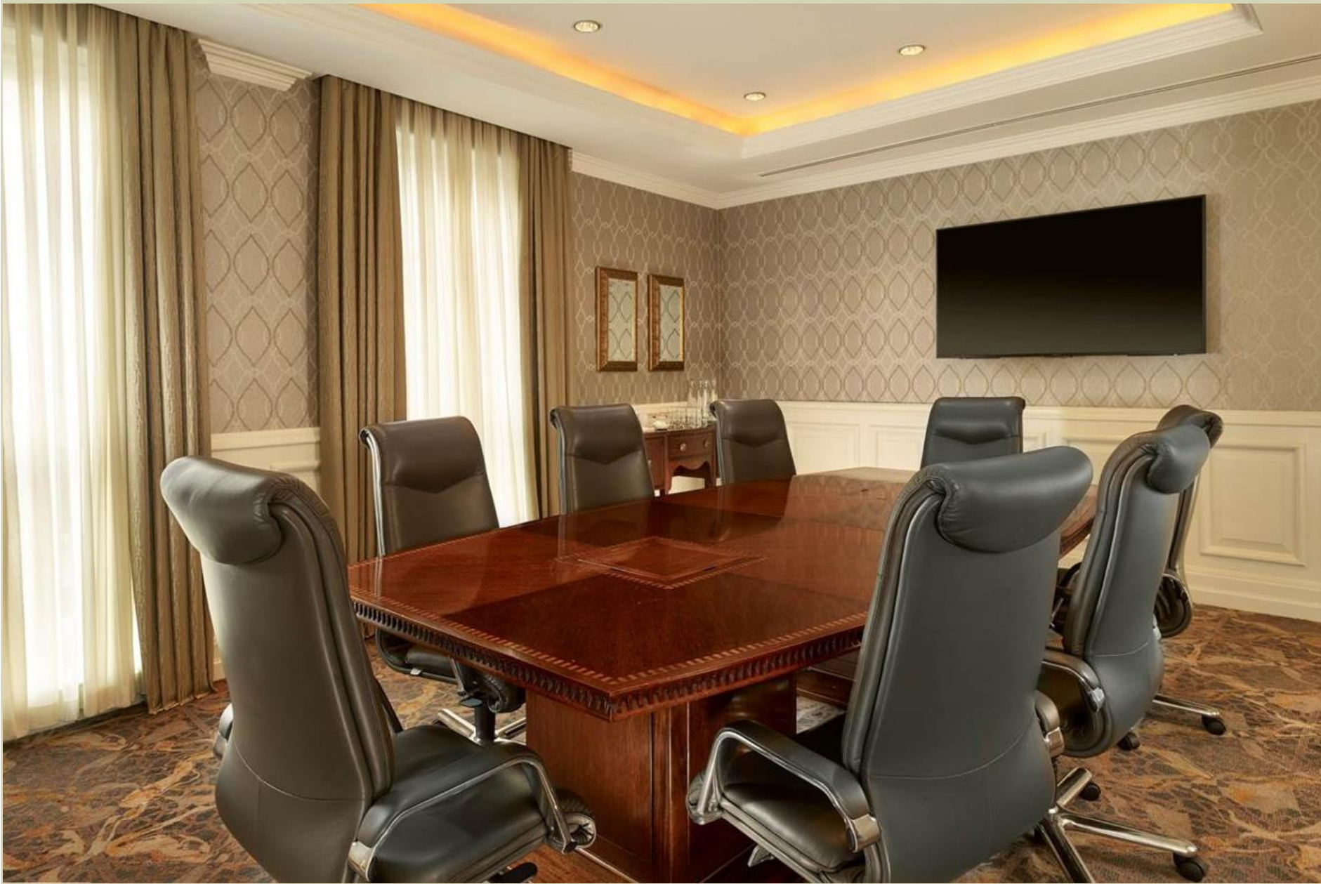
The Shilling Boardroom – dedicated executive boardroom