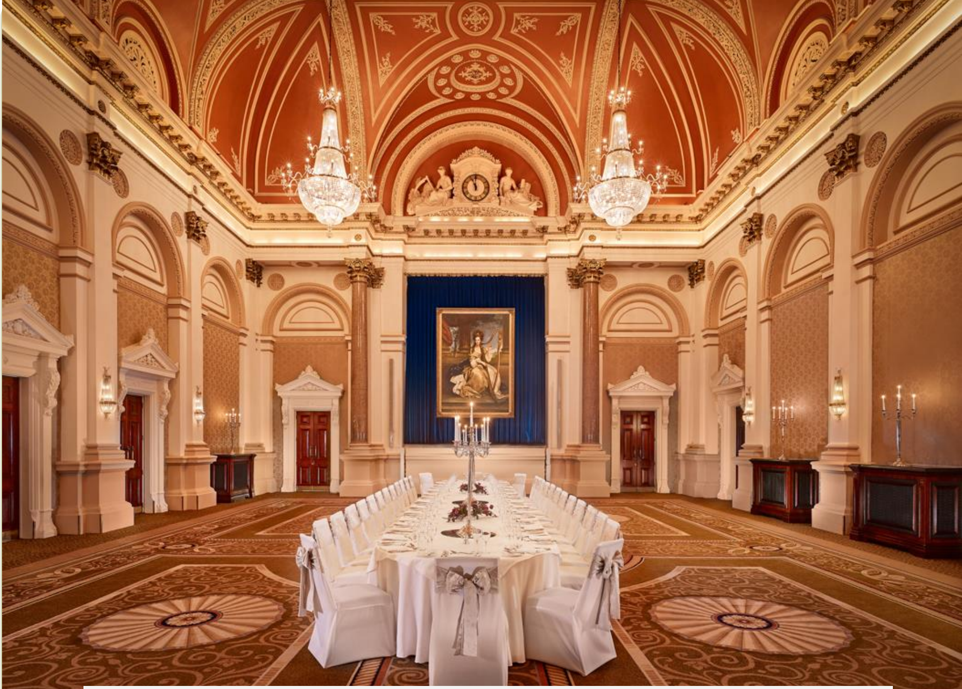
The Banking Hall