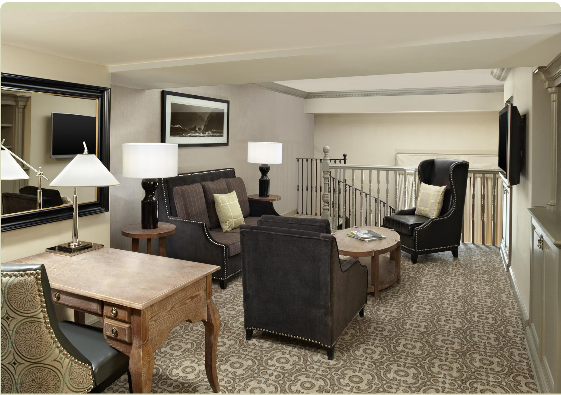
Library Suite Lounge