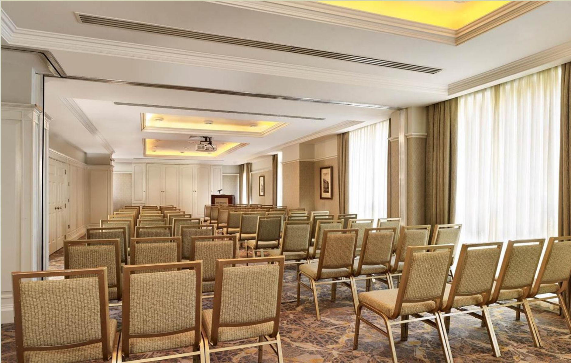
The Mezzanine Level 6 dedicated meeting room & private pre-function area