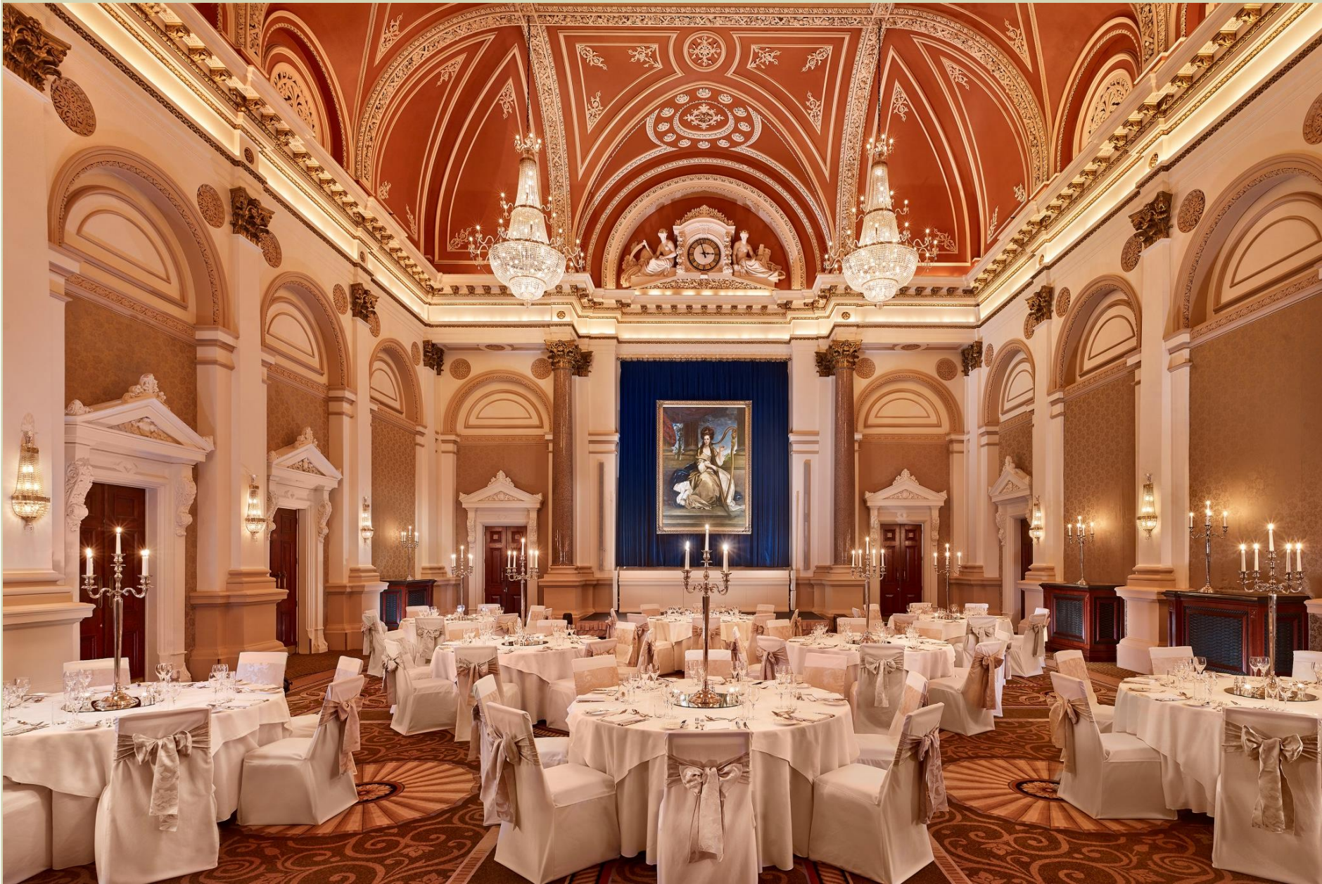
The Banking Hall, dating back to 1866 hosting gala dinners for up to 180 persons