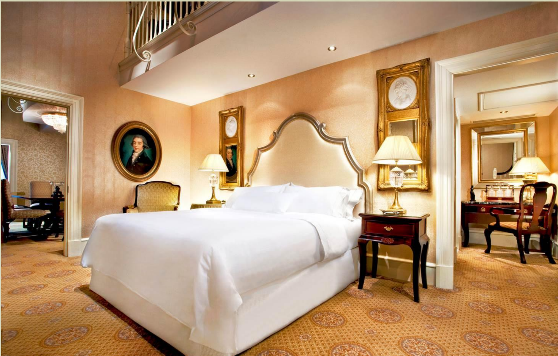
Presidential Suite – 82sqm, over 2 floors & featuring corner balcony overlooking Trinity College & College Green