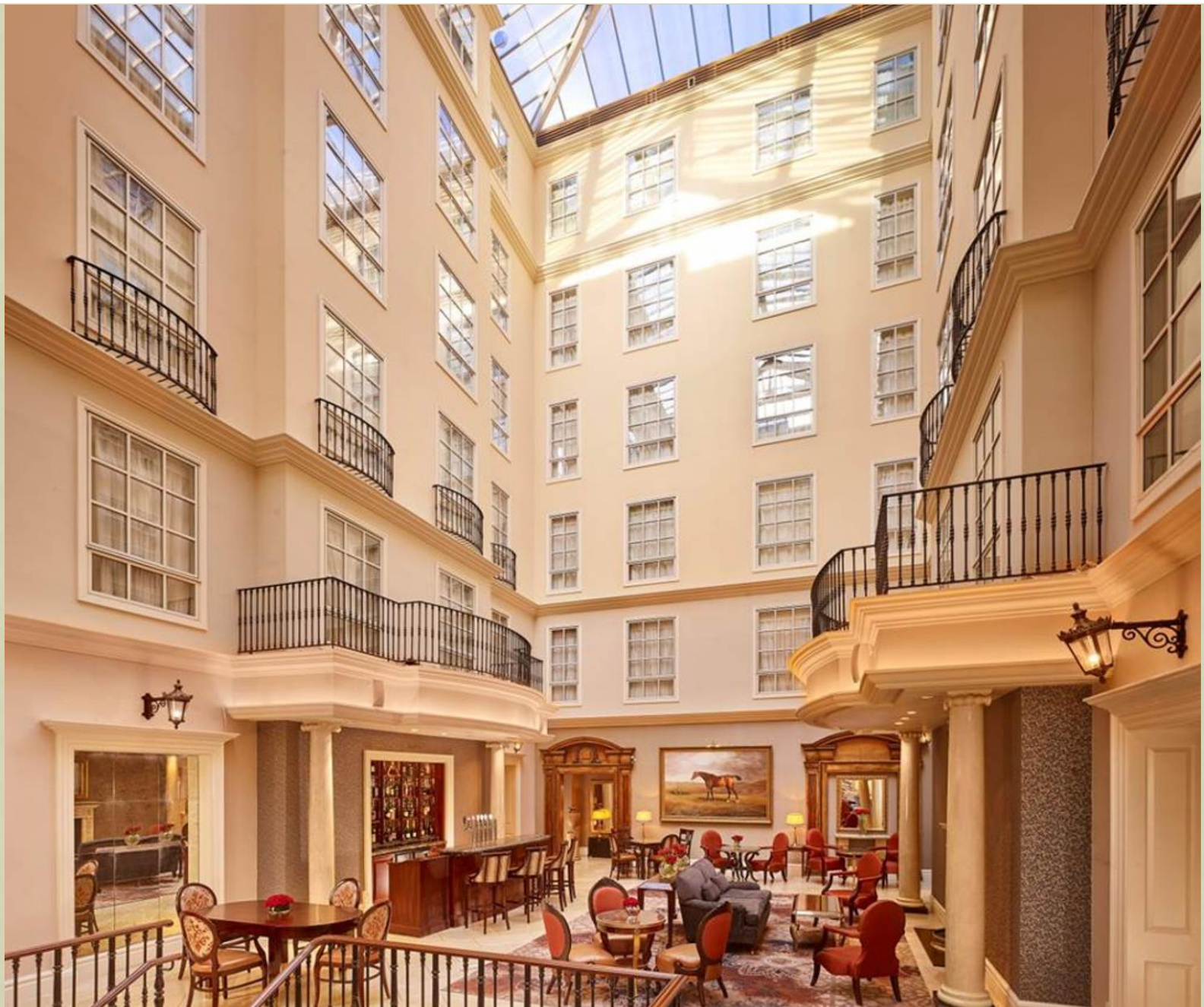
Atrium Lounge home of the Famous “Most Peculiar Afternoon Tea”