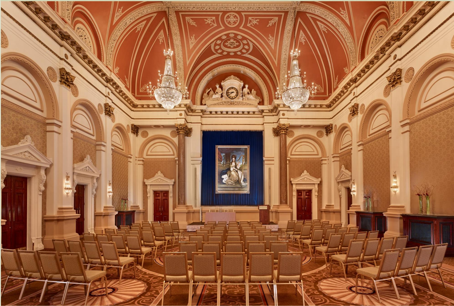
The Banking Hall, theatre up to 270 & classroom 144 delegates