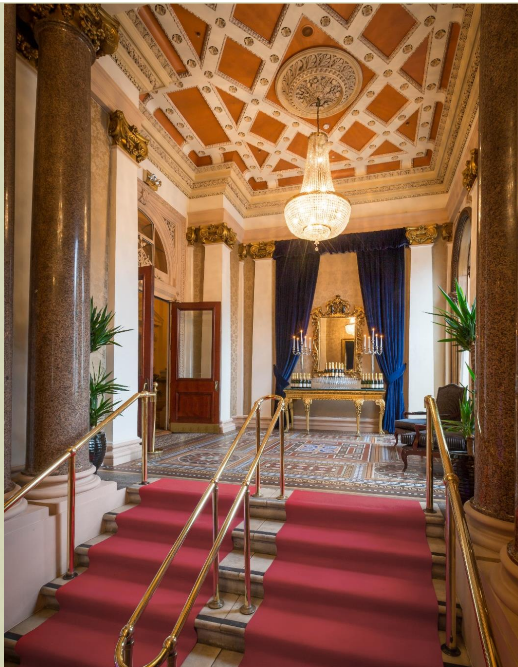
Private entrance into The Banking Hall