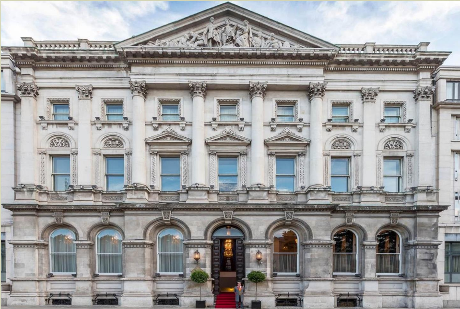
The Banking Hall – Dublin's iconic destination venue in the city centre