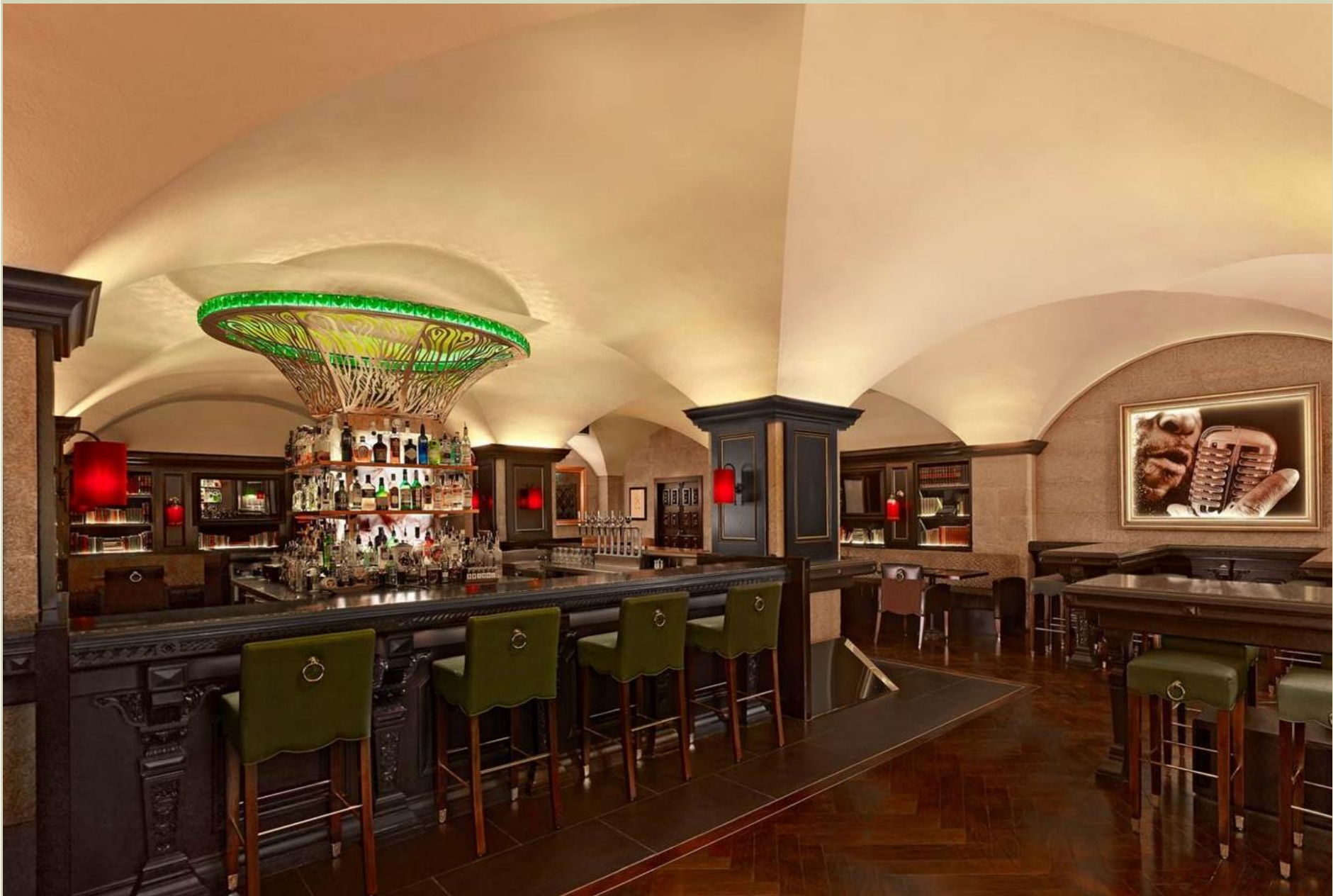
The Mint Bar – atmospheric venue located in historic bank vaults